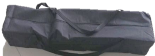
Outer carry bag x 1 pc