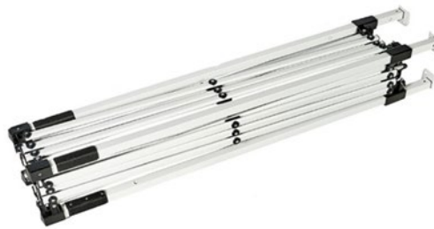
Folding Steel Frame x 1 pc