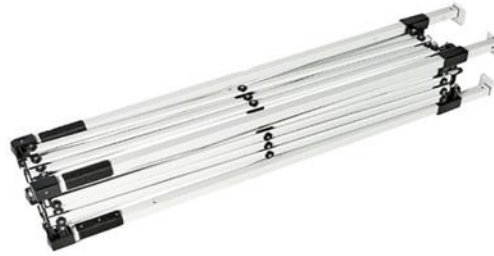
Folding Steel Frame x 1 pc