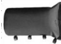
Counterweight bag x 4 pc