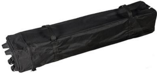
Outer carry bag x 1 pc